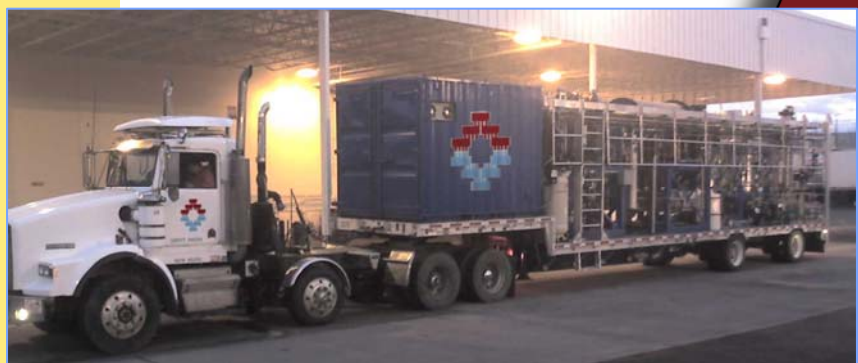
Mobile unit at Fort Riley Kansas